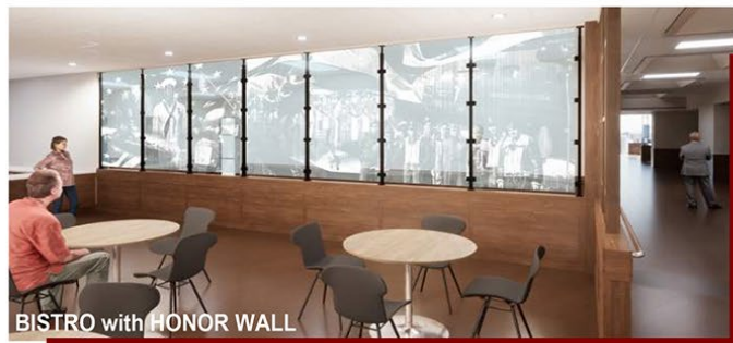
BISTRO with HONOR WALL