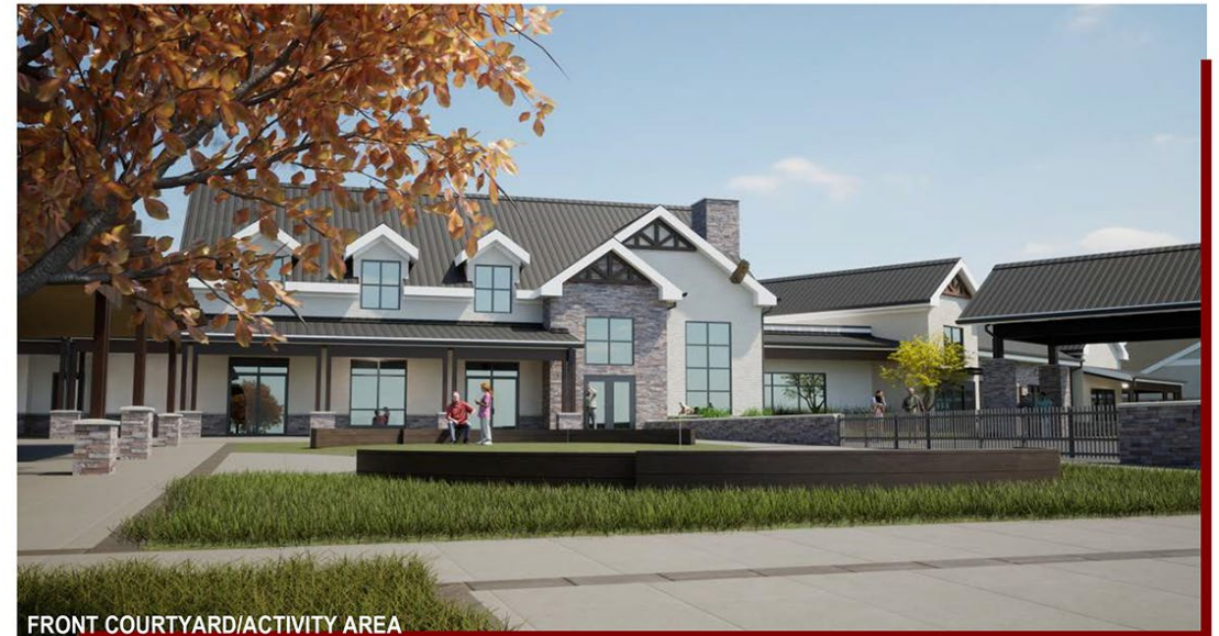
FRONT COURTYARD/ACTIVITY AREA