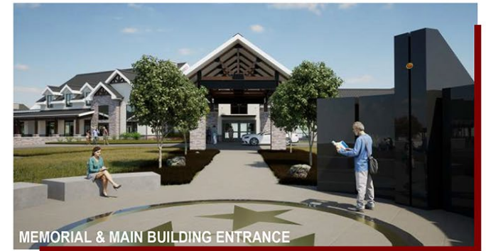
MEMORIAL & MAIN BUILDING ENTRANCE